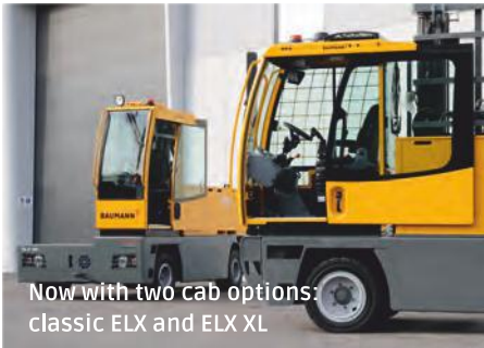
Now with two cab options: classic ELX and ELX XL

COMFORT A wider cabin allows for a wider dashboard; the hydraulically mounted cabin is more comfortable and by being 20% longer, the operator legroom is also improved.