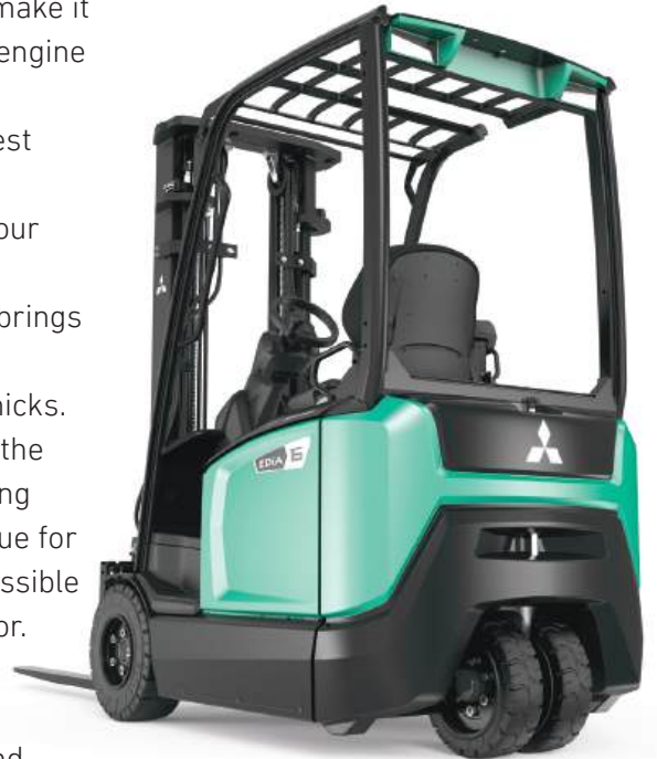
EDiA EM • FB16N2T

And everything has to be worthy of the name: EDiA . The Electric Diamond.