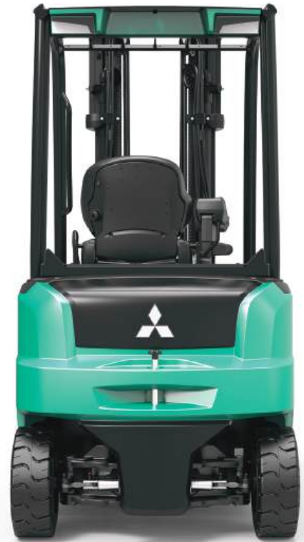
EDiA EM • FB20N2

Build for the most important part and everything else will follow.