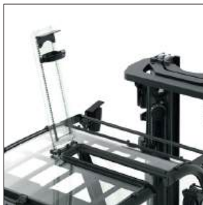
Crane segment option