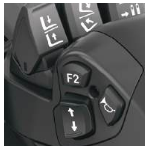
F2 thumb button