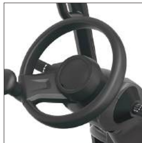
Comfortable steering position