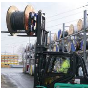
Low Noise Lift

As the largest electric models in the Mitsubishi Forklift Trucks range, the FB60-120N(H) series delivers huge power, with no compromises to performance and precision. Best-in-class acceleration and smart energy use makes for a highly efficient addition to any work site.