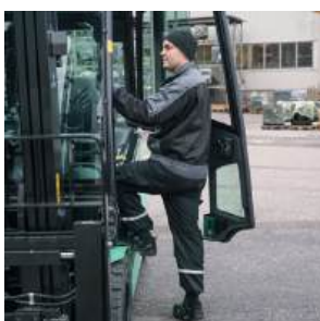
Easy on/off access