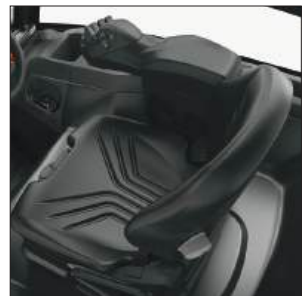
Ergonomic seat and armrest