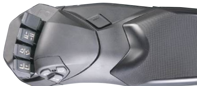
ErgoCentric adjustable armrest with integrated fingertip control

Controls have a natural-feeling, spring-loaded response: press gently for finer control.