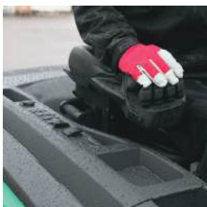
Works in any weather

4-wheel solid pneumatic tyres 80V AC Power 2.5–3.5 tonnes