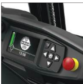
Bright and clear colour display