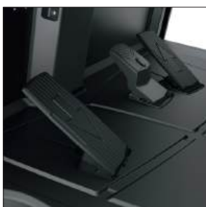
Optional direction pedal