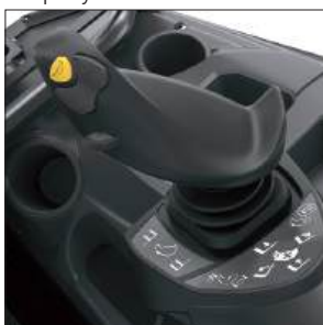
Ergologic single joystick

Smart. Safe. Agile. EDiA EM is a lot of truck in a compact package. Legendary Mitsubishi Forklift Trucks engineering, exceptional ergonomics, and cutting-edge technology — like AutoBoost and Adaptive Lift Control — combine to make EDiA a favourite of drivers and businesses alike.