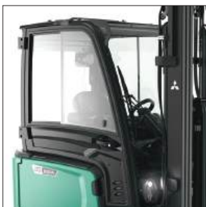
Wide range of cabins