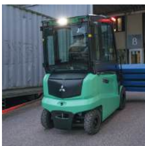
Automatic parking brake with hill hold

Everything about EDiA EX inspires confidence. Our design team worked to build something that's robust yet nimble, technologically advanced yet completely intuitive to control. EDiA gives you confidence to do the job knowing it'll always be up to the task, every time. With Four Wheel Steering and impressive residual capacities you get big-truck performance that works in tight spaces. And AutoBoost means you'll never feel like you're lacking power.