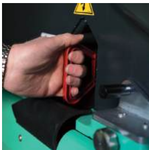
Easy charging access