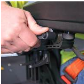
Adjustable driver position