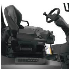
Fully featured cabin