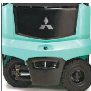
Rear axle steers more than 100 degrees