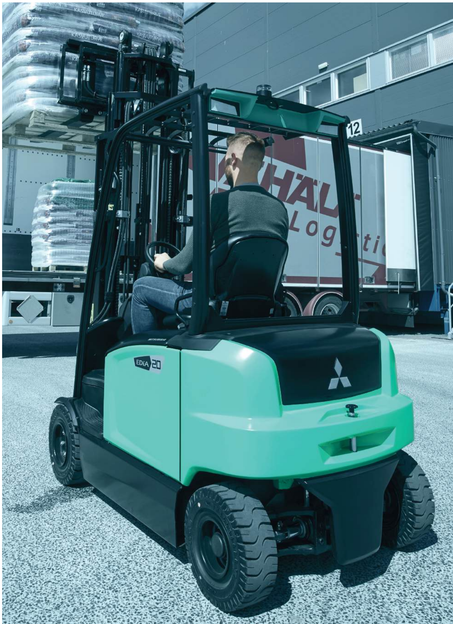
EDiA EM • FB20N2