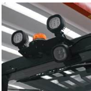
LED work lights