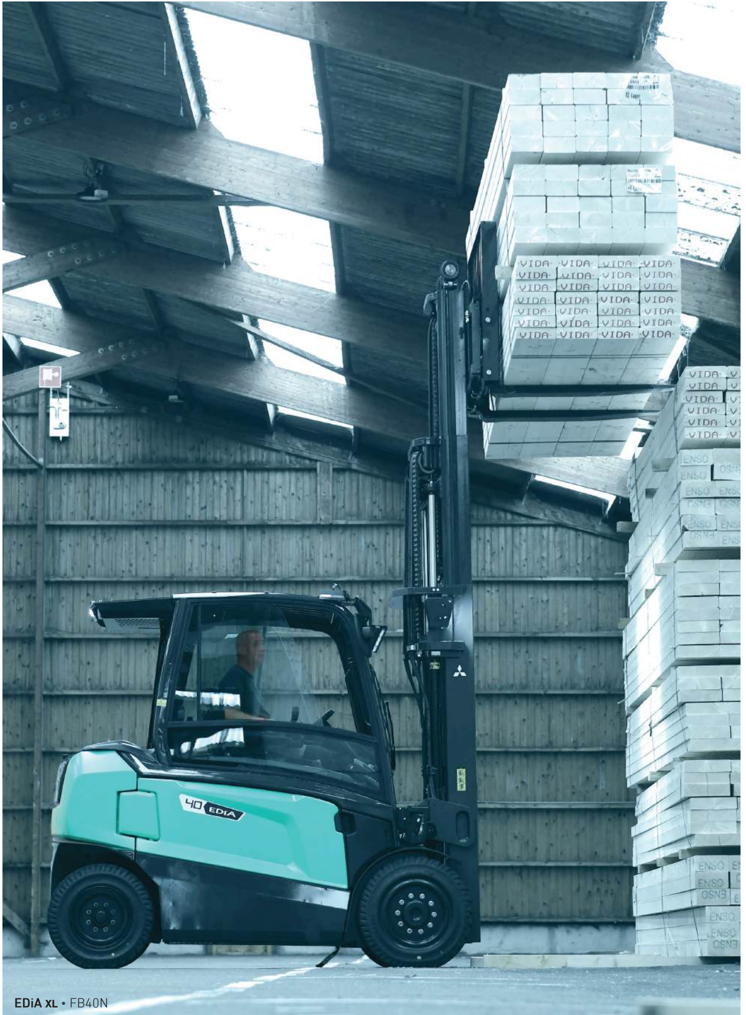
EDiA XL • FB40N