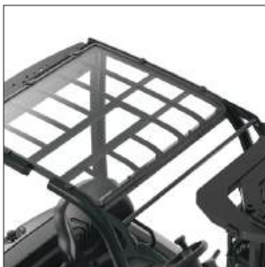
Optional acrylic roof