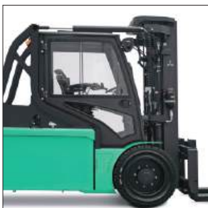
Low overhead guard for container applications