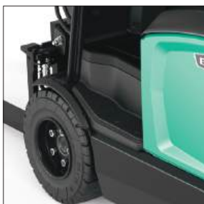
Easy on/off access

3 and 4-wheel solid pneumatic tyres 48V AC Power 1.4–2.0 tonnes