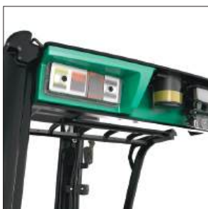
Optional lighting kits

This mode optimises energy efficiency and gives smoother performance. Ideal for long shifts, training, new users, and part-time users.