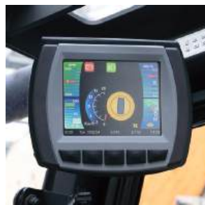
Interactive colour display