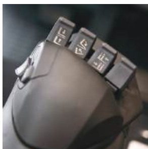
Responsive fingertip control