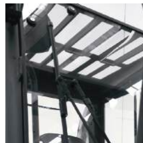
Front screen and roof with wiper/washer