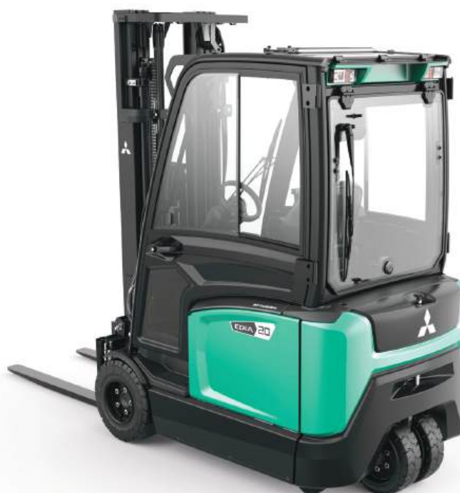
EDiA EM • FB20N2T

The operator can keep the truck in constant motion – saving seconds on every turn. (Option)