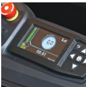
Clear, informative colour display