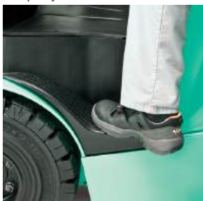
Extra-large entry step