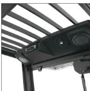
Clear-view overhead guard

It is well known that if an operator is comfortable they will be more productive. EDiA XL features a rubber-sealed cabin that minimises micro-vibrations, and the overall noise level inside the cabin is just 65 dB.