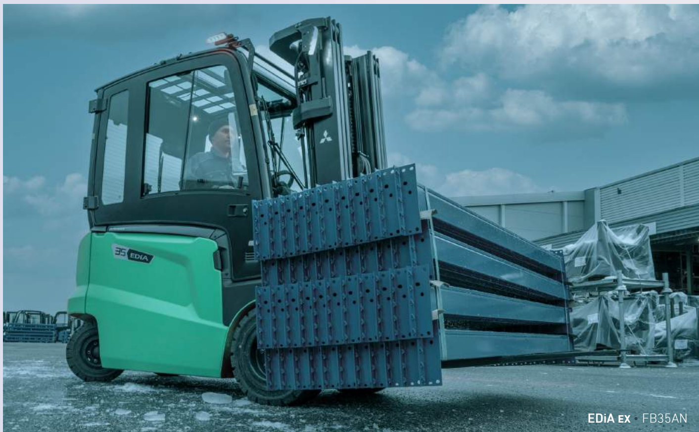
EDiA EX FB35AN