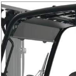
Optional sun visor