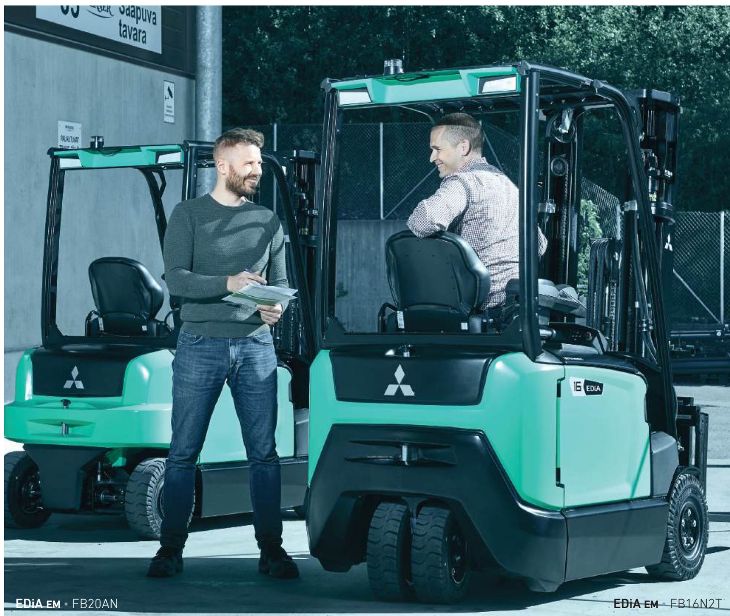
EDiA EM • FB20AN