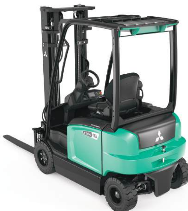
EDiA EM • FB20N2T

When activated, both front wheels spin simultaneously, giving the truck better traction and control in slippery conditions.