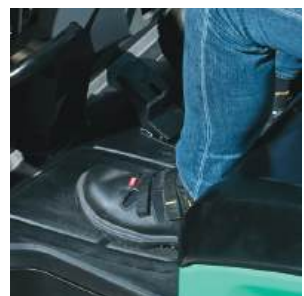
Large floor space